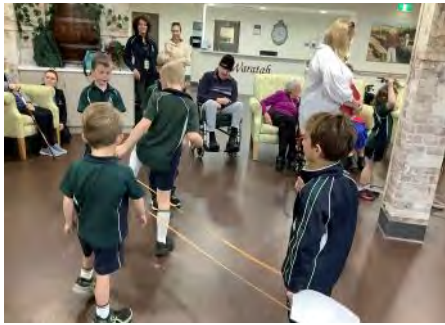
Faith Students playing elastics